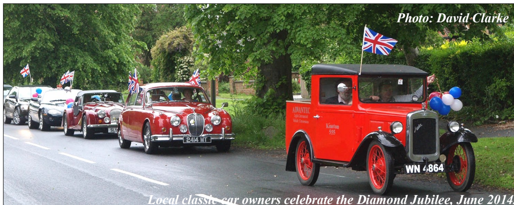
Local classic car owners celebrate the Diamond Jubilee, June 2014.