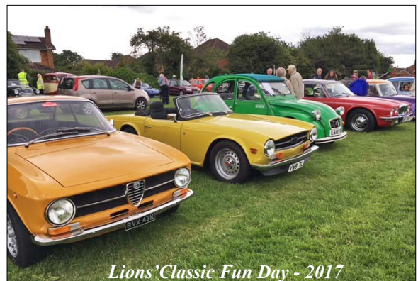
Lions' Classic Fun Day - 2017

As most of you will probably be aware, we will no longer be holding our annual raft race. Unfortunately, numbers have declined over the last few years and this, plus some logistical problems, have meant that we have reluctantly taken the decision to concentrate our fundraising efforts on alternative events. We are really hoping that our Classic Fun Day, which will be taking place on Sunday, 1 July, will be a great success. It will be held at Wellesbourne Sports Field and will run from 12.00 noon until 4.00pm. There will be classic vehicle displays, children's go-karts, bouncy castles, family games, tombola, food, drink and loads more! Entry is free. The Lions are finalising plans for the big day and we are hoping for a bumper crowd, plus some luck with the British weather!