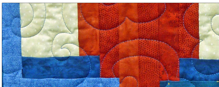
A detail of the quilt, (see the colours on the website)