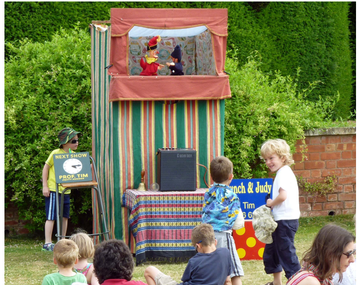
The ever popular Punch and Judy at Loxley Strawberry Fayre, (note the irresistible peep round the back!)

Being blessed with a sunny summer day on 10 July, Loxley held a very successful Strawberry Fayre. Once again the gardens of Loxley Hall made a beautiful setting, thanks to the hospitality of Peter Gregory-Hood. People from near and far flooded in and enjoyed the stalls and entertainment, as well as a delicious tea provided by the village ladies who had baked cakes, prepared sandwiches and hulled 75lbs strawberries for over 300 people! The villagers are delighted to have raised almost £2,500 for church funds. LL