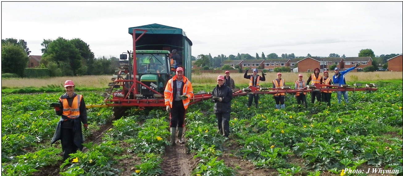
One of the picking teams harvesting courgettes in Hampton Lucy - smiles all round.